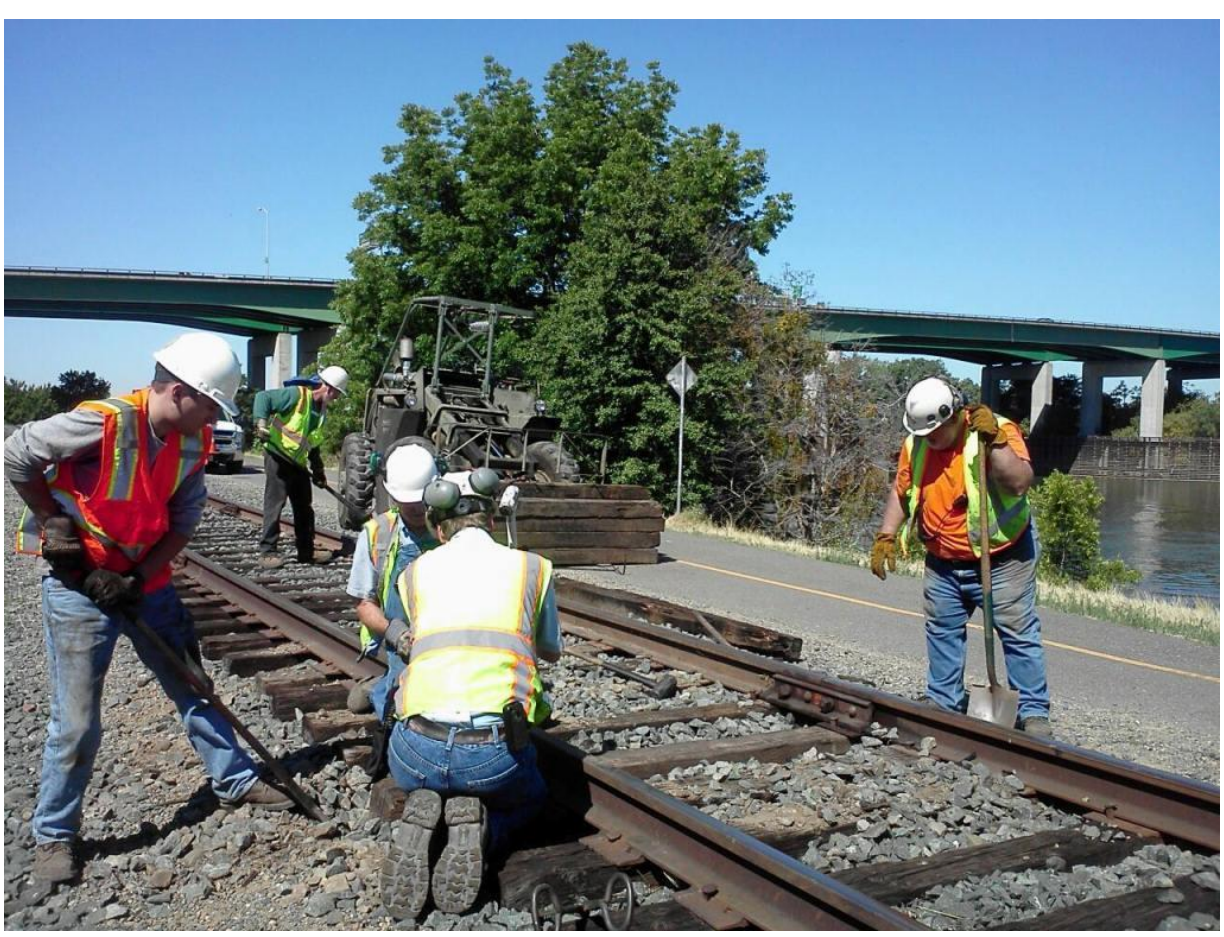
Your MOW Team at work...